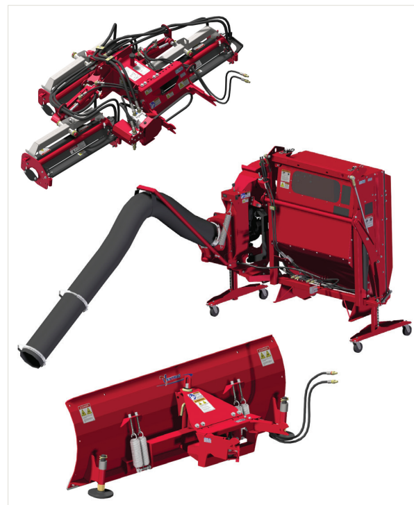
Attachments designed for Ventrac tractors must fit perfectly.