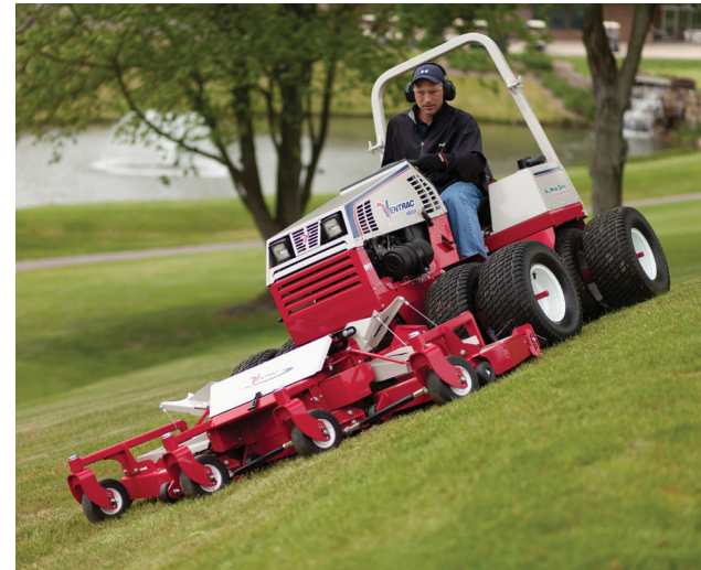
The new Ventrac 4500 tractor is used by landscapers, municipalities, churches, universities, golf courses, homeowners, parks, sport facilities, shopping malls, tree growers, rental yards, nurseries and airports.

Venture used 2D AutoCAD® software from Autodesk for many years. With a power